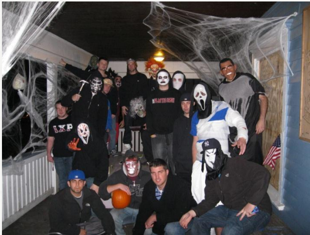
SUNY Plattsburgh Haunted House