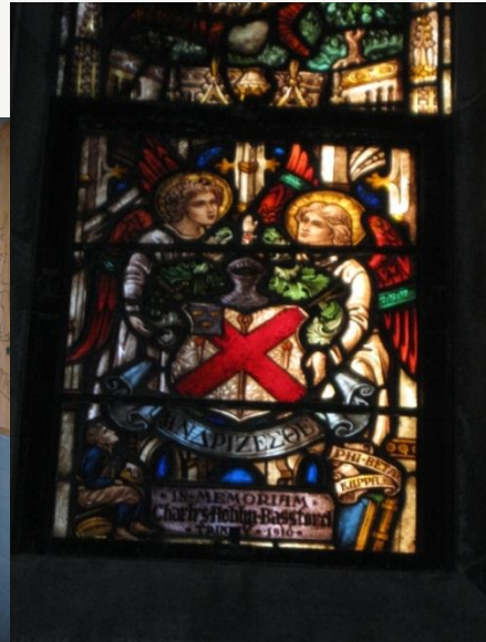
Stained Glass Window at Trinity College Chapel