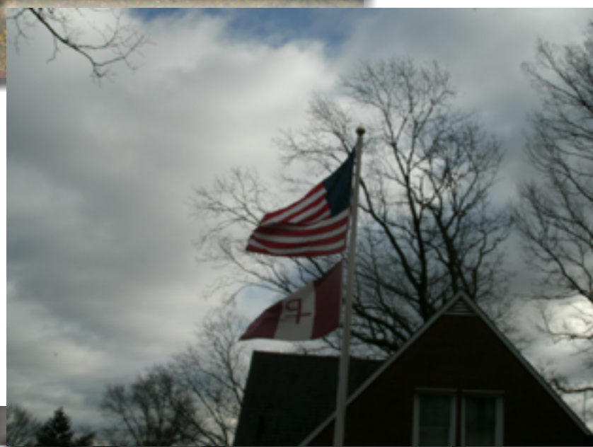
Right: National Flags weather the storm.