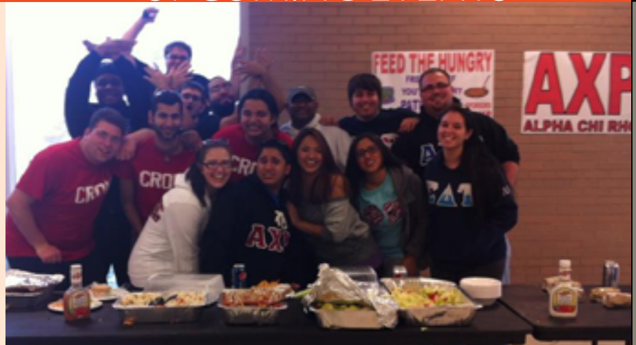
Above: Queens College Colony's "Feed the Hungry" event with Sisters of Delpha Phi Epsilon and Sigma Delta Tau Sororities.