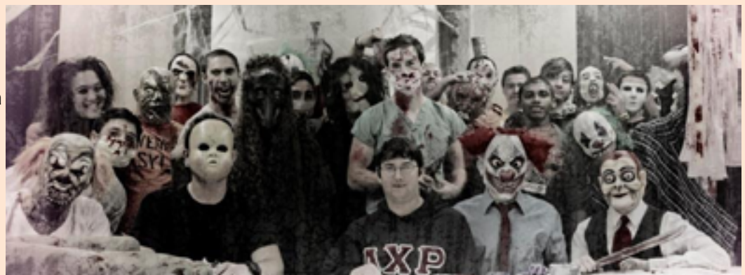
Below: Group Photo of Alpha Phi Alpha's (Philadelphia University) Haunted House for American Cancer Society.