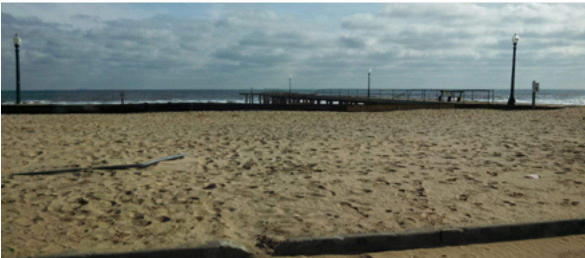
Remnants of the Ocean Grove Fishing Pier.

Thanks to the many power companies' crews from Oklahoma, Ohio, and Pennsylvania just to name a few and the tree removal companies from North Carolina and Virginia- they all played a part in the return to normalcy. In the end, the National Office was closed for two weeks in large part due to lack of electricity, telephones and internet.