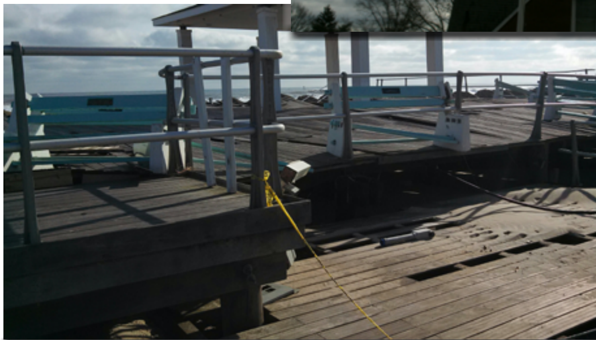
Bottom: Avon boardwalk damaged by Sandy.