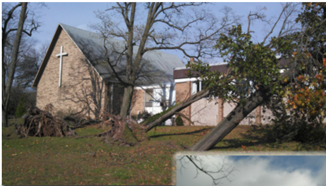
Above: Church Next to HQ and their tree damage.