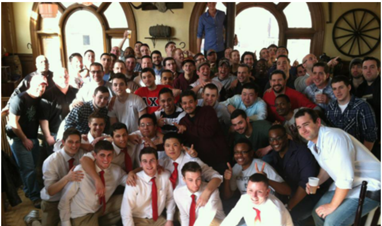
The Chapter at the State University of New York at Albany, Mu Chi Phi, celebrates twenty years of being a Chapter!

Colonies presently open and moving toward full Chapter status are Queens College, California University of Pennsylvania and Shippensburg University of Pennsylvania.