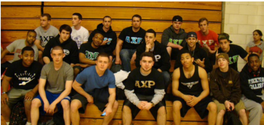
Brothers of the Phi Eta Chi Chapter, Richard Stockton College, pose for a photo after their Greek Week Basketball championship victory.

Aside from the occasional blizzard in northern New York and spring breaks during the whole month, my travels for the month of March have been a pleasure. I'm looking forward to my remaining visits and I'm ready for summertime in Neptune, New Jersey!