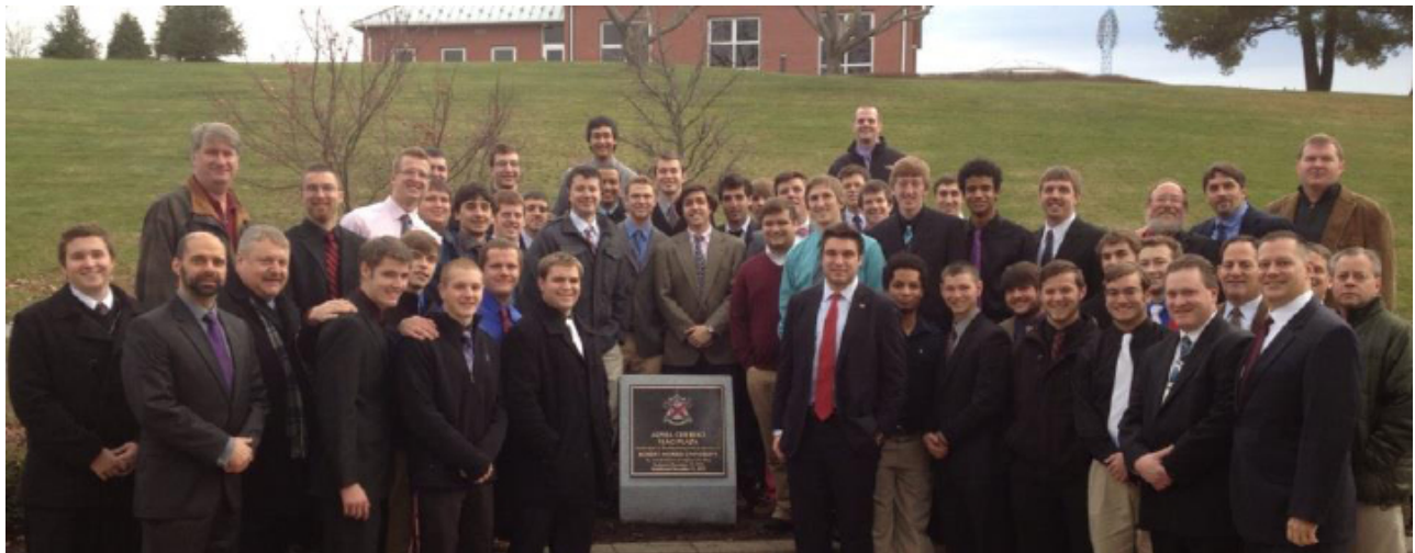
Above: Photograph of the Pi Chi, Robert Morris University, Chapter (Alumni and Residents). Below: Photographs of Robert Morris University Campus.

The event will begin on the evening of October 25th with a welcoming ceremony. The basketball tournament will be held on October 26th. Informational packets will be sent out over summer including detailed agendas, registration forms, and any other information a participating Chapter would need to know. The Brothers of the Pi Phi Chapter are very excited to be holding the annual Crowball event and are looking forward to your arrival this fall!